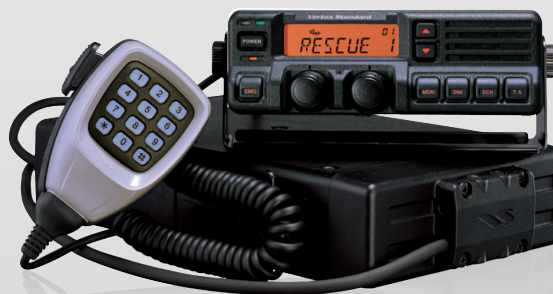
REMOTE MOUNT CONFIGURATION